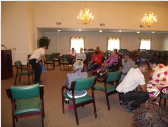
Residents Getting Their Daily Exercise.