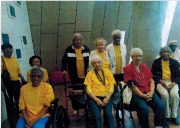
Residents Posing for a "Pic" After a Powerful Tour of the Civil Rights Museum.